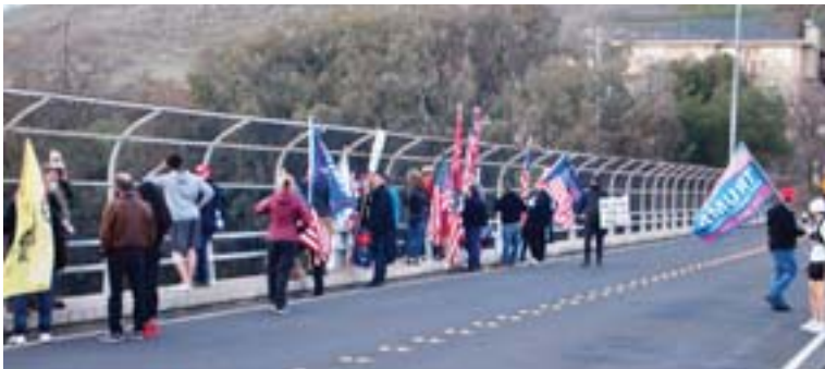
Trump supporters on the overpass Jan. 15.